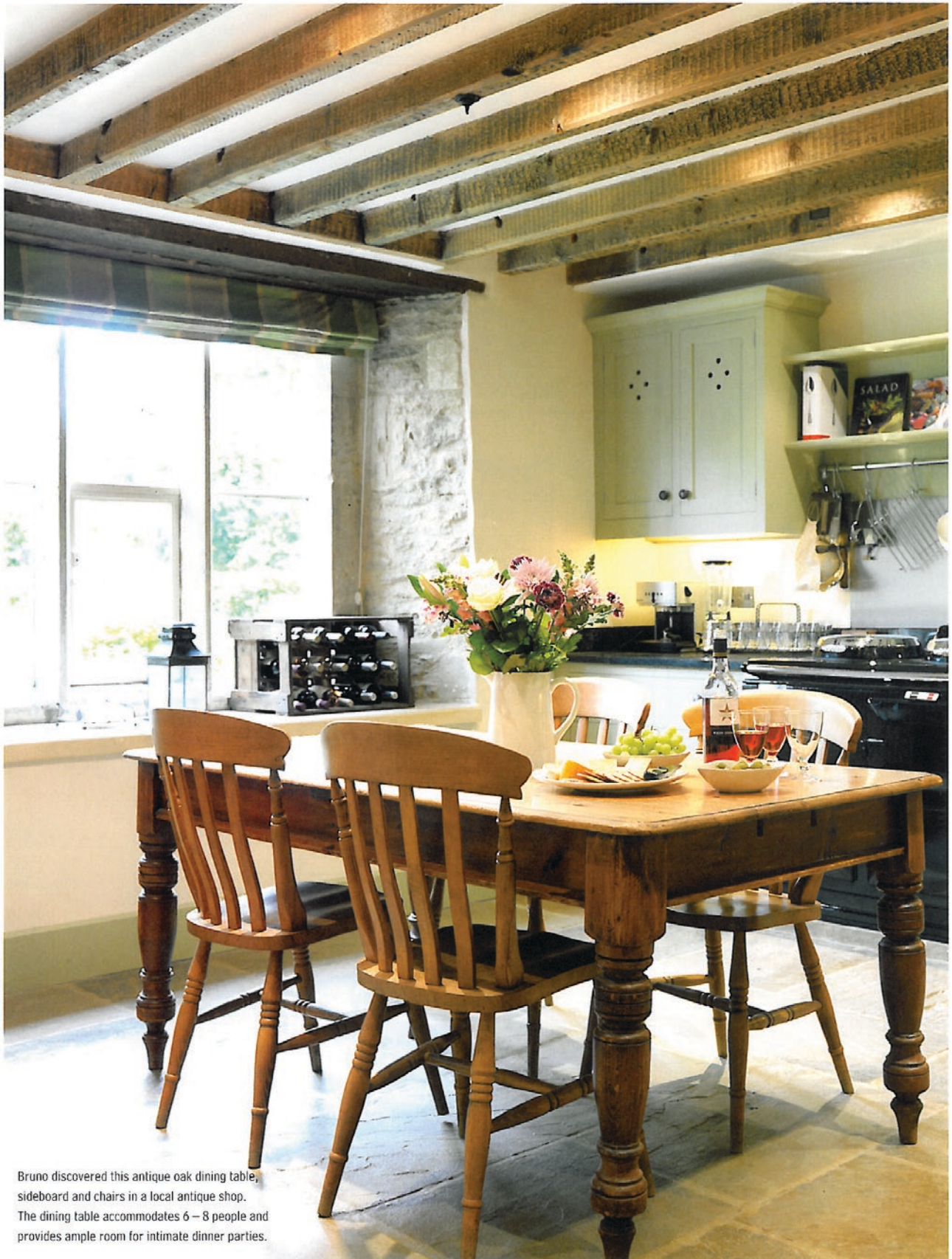
Bruno discovered this antique oak dining table, sideboard and chairs in a local antique shop. The dining table accommodates 6 – 8 people and provides ample room for intimate dinner parties.