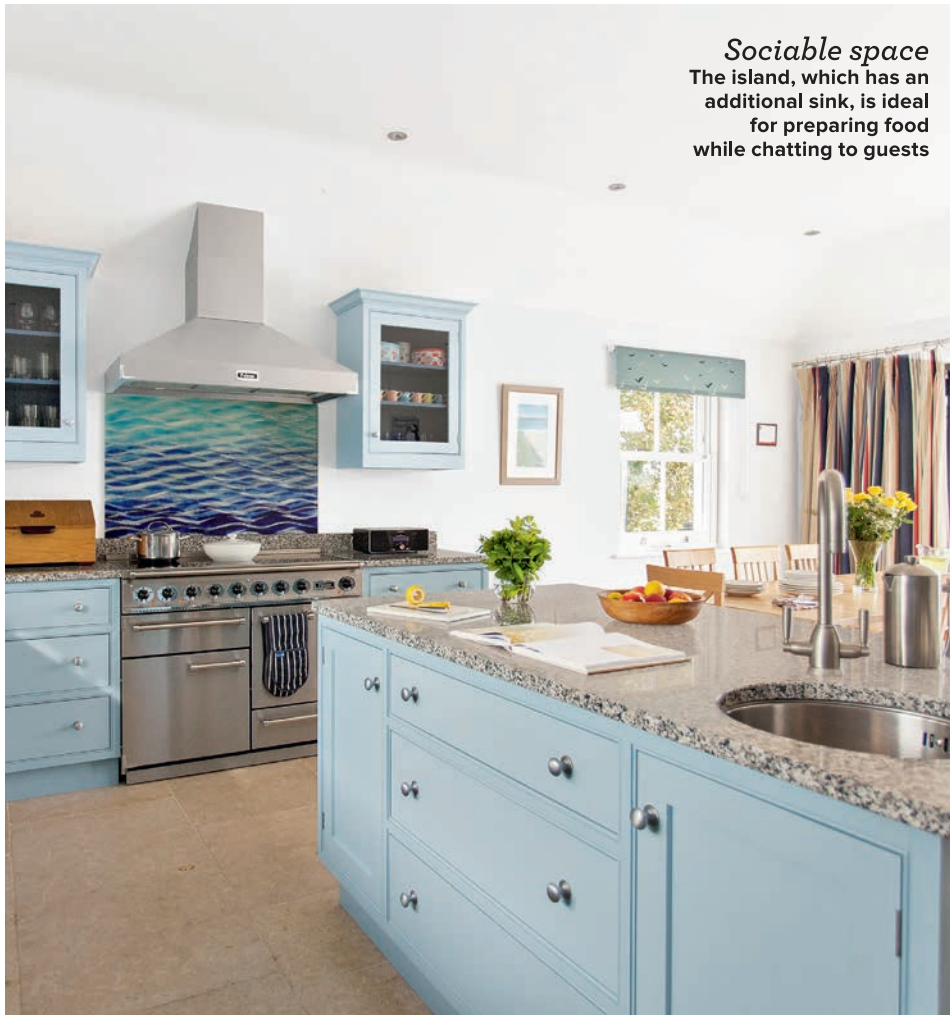
Sociable space The island, which has an additional sink, is ideal for preparing food while chatting to guests

FEATURE VICTORIA JENKINS PLAN PERSONAHD