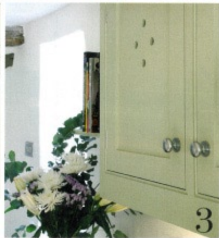
TEXT: NAHLE ELJAIM