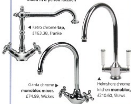
◀ Retro chrome tap, £163.38, Franke

Traditional-style taps set the nostalgic mood in a period kitchen