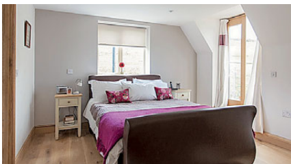
The sleigh bed in the main bedroom is made of leather and is teamed with a Neptune chest of drawers and a reupholstered old chair