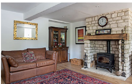
In the sitting room, the couple installed new oak flooring, a new chimney and a wood burner

were growing where a lovely flat lawn was supposed to be. I spent weeks and weeks pulling up the blooming plants!"