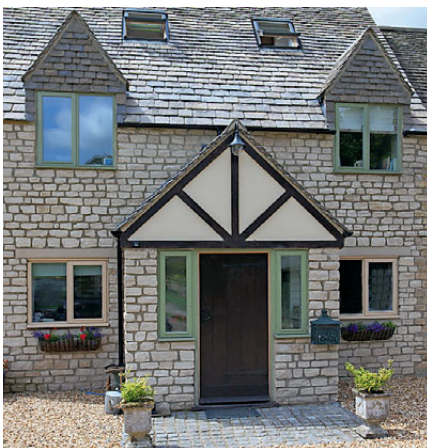
The Lazaros' charming cottage extension is built of Cotswold stone and Bradstone roof tiles. To the right is their part of the original cottage which they bought from owners wanting to downsize. They have a half-acre garden, having bought extra land off the neighbouring farmer to avoid having cows looking through their windows

Not very long ago Gordon and Vanessa Lazaro lived in an old cottage near Tunbridge Wells in East Sussex. It sounds idyllic but Vanessa says, "It was cold, draughty and the heating bill was astronomical. Plus it was always a bit of a squeeze and when we entertained it was positively crowded."