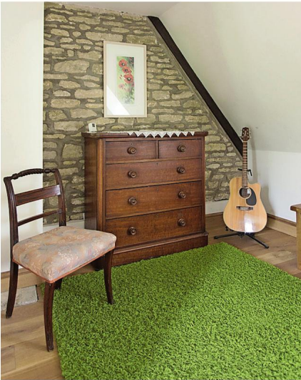
The chest of drawers in the guest bedroom is Regency