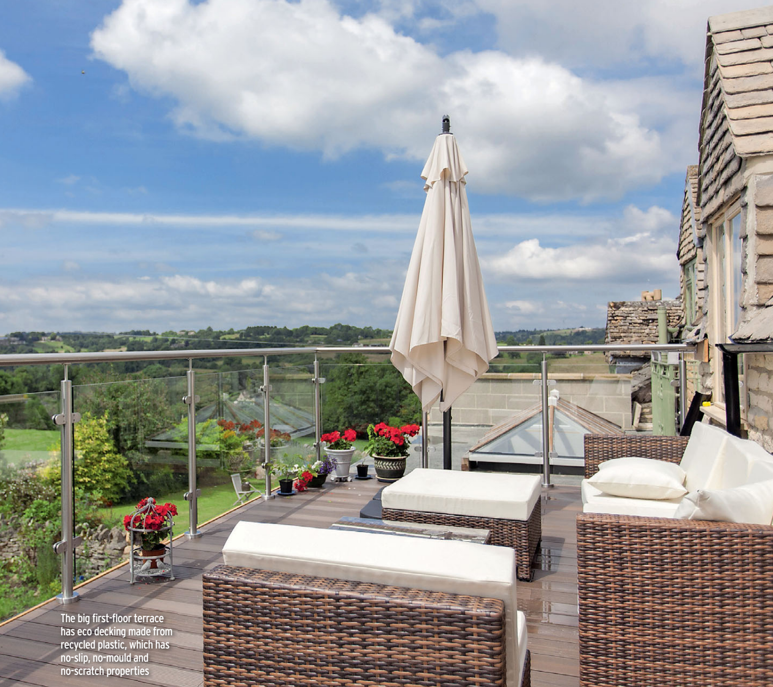
The big first-floor terrace has eco decking made from recycled plastic, which has no-slip, no-mould and no-scratch properties