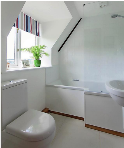
The Pegasus bath is fitted with a whirlpool, and there is a Jacuzzi basin